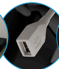
USB Power Supply