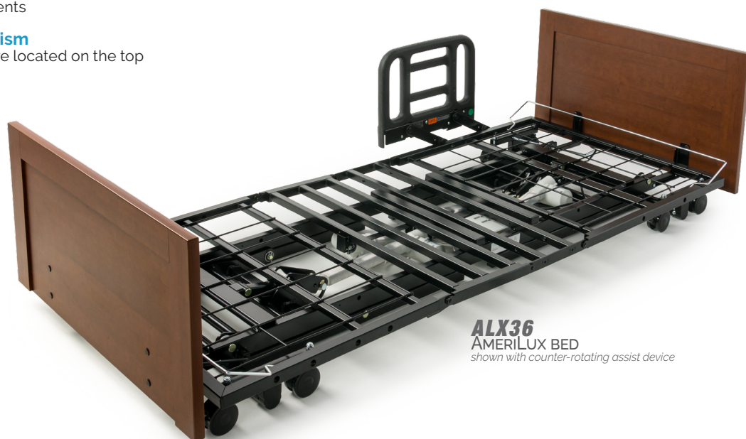
ALX36 AMERILUX BED shown with counter-rotating assist device